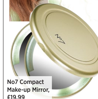
No7 Compact Make-up Mirror, £19.99

★ Now add colour. I love Max Factor Miracle Touch Creamy Blush in Soft Copper, £6.99. Blend on your lips and cheeks. ★ Apply mascara when you're stationary and wiggle the wand at the roots to give you an eyeliner effect.